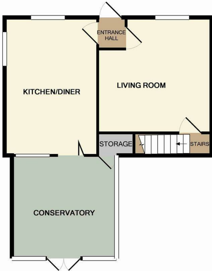
GROUND FLOOR APPROX. FLOOR AREA 535 SQ.FT. (49.7 SQ.M.)